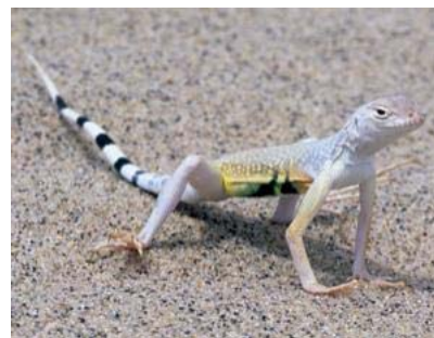
Fluid mover (Image: Gerald &amp; Buff Corsi/Visuals Unlimited/Corbis)